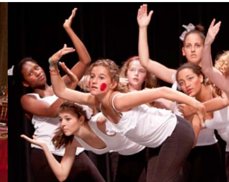
Students get creative for the noontime show at Camp Arena Stage